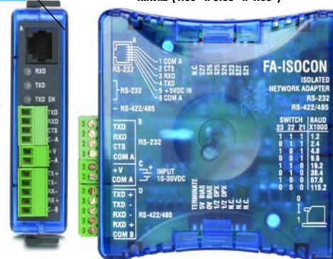
Removable terminal blocks make it easy to connect communication wiring. (Replacement terminal plug kit FA-ISOCOCON-P)