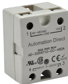
AD-SSR640 SOLID STATE RELAYS