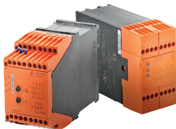
SAFETY RELAY MODULES