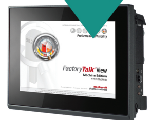
Moxa Panel PC