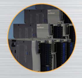
Maximum 2.060 Discrete I/0 No other micro PLC in the market can match this capacity.