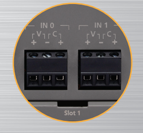
Maximum 511 Analog I/O Easily handle even the most complex and large process control applications.