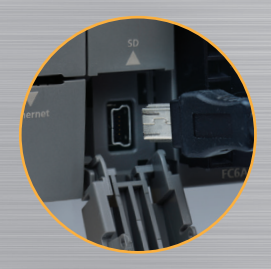
USB Port Can be used to provide power, or to transfer software programs from a PC to the CPU. Can also be used for PC-based monitoring of the PLC.