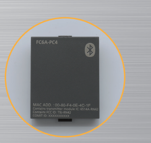
Bluetooth, Analog and Discrete I/O Cartridges These cost-effective I/O cartridges allow users to add I/O point and Bluetooth communication.