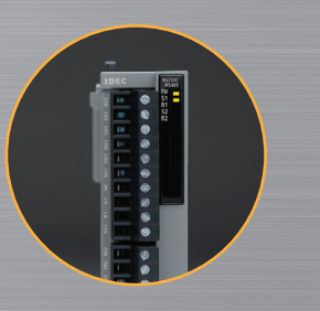
Up to 33 Serial Ports Using a combination of communication cartridges and RS232C/RS485 expansion interface modules, up to 33 serial ports can be utilized, 10x more than any micro PLC in the market.