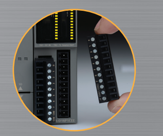
Removable Terminal Blocks Simplifies wiring, installation and module replacement—just wire a terminal block and plug it into a module.