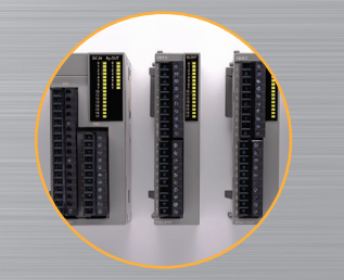
Expansion Modules Up to 63 expansion modules make the MicroSmart FC6A Plus the most powerful in the market.