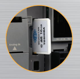
SD Memory SD card for data logging, program storage/transfer, firmware updating or recipe storage.